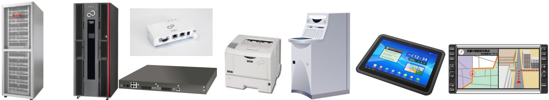
IVI: In-Vehicle Infotainment